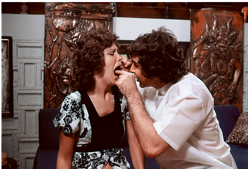
Linda Lovelace and Harry Reems in Deep Throat

Hot on the heels of its 50th Anniversary World Tour, a 4K restoration of “Deep Throat” will screen at CineKink to help us celebrate our 20th! Afterwards, a panel will discuss the impact the iconic film has had over the years. No one involved in the production, cast or crew, had any idea of the unprecedented success the film would achieve. It would usher in an era now referred to as “Porno Chic” and change American culture forever.